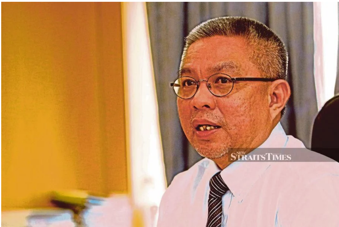
Health Minister Datuk Seri Dr Adham Baba.

PUTRAJAYA: The Special Committee on Covid-19 Vaccine Supply Access Guarantee (JKJAV) is in the process of fine-tuning the Covid-19 National Vaccination Plan, which will be available for all Malaysians.